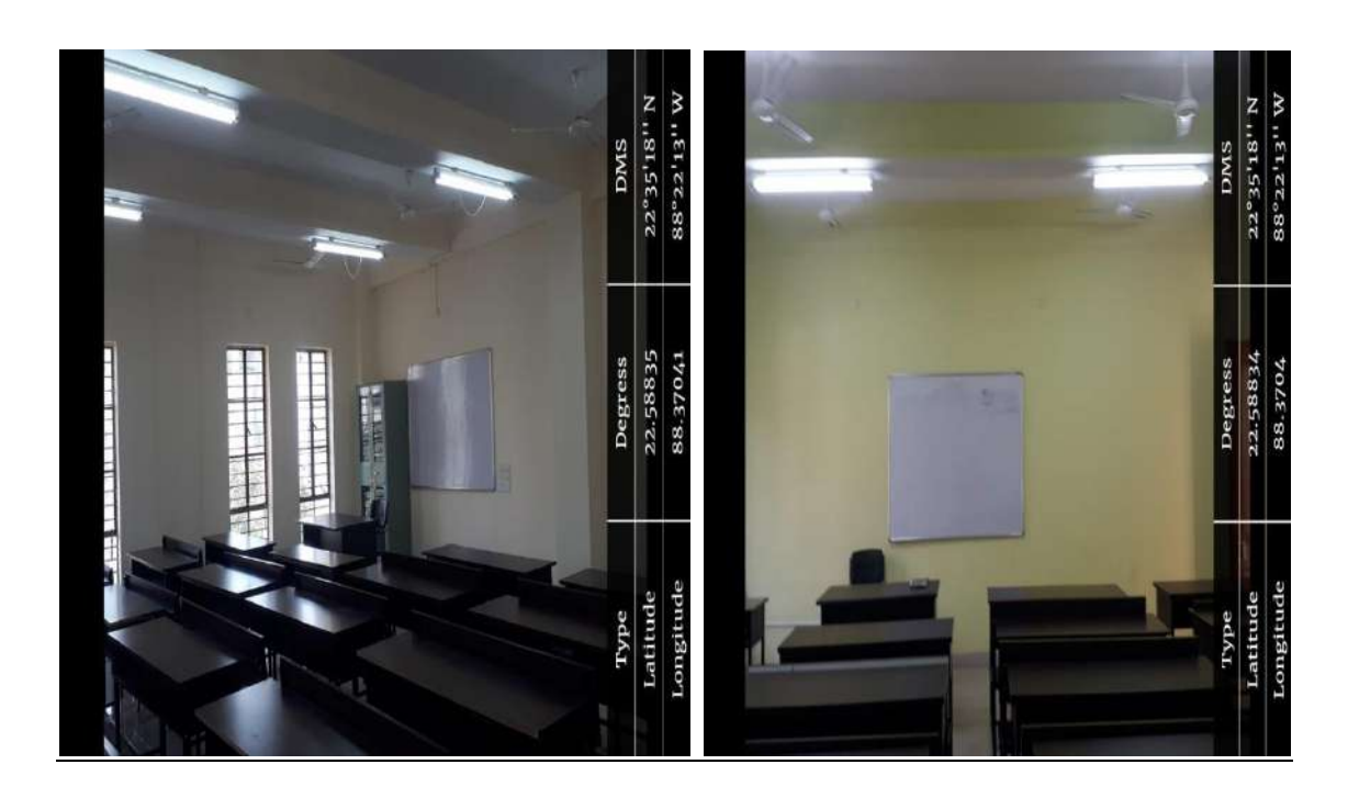
LED LIGHTS IN CLASSROOMS