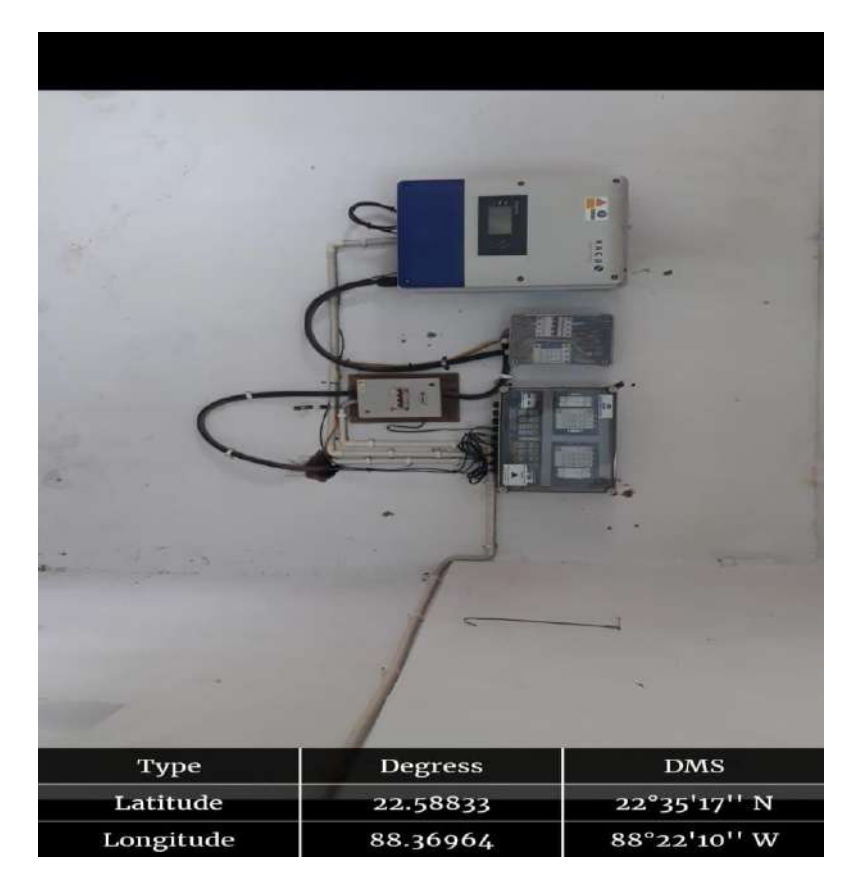
SOLAR METER THROUGH WHICH SOLAR ENERGY IS WHEELED TO THE GRID