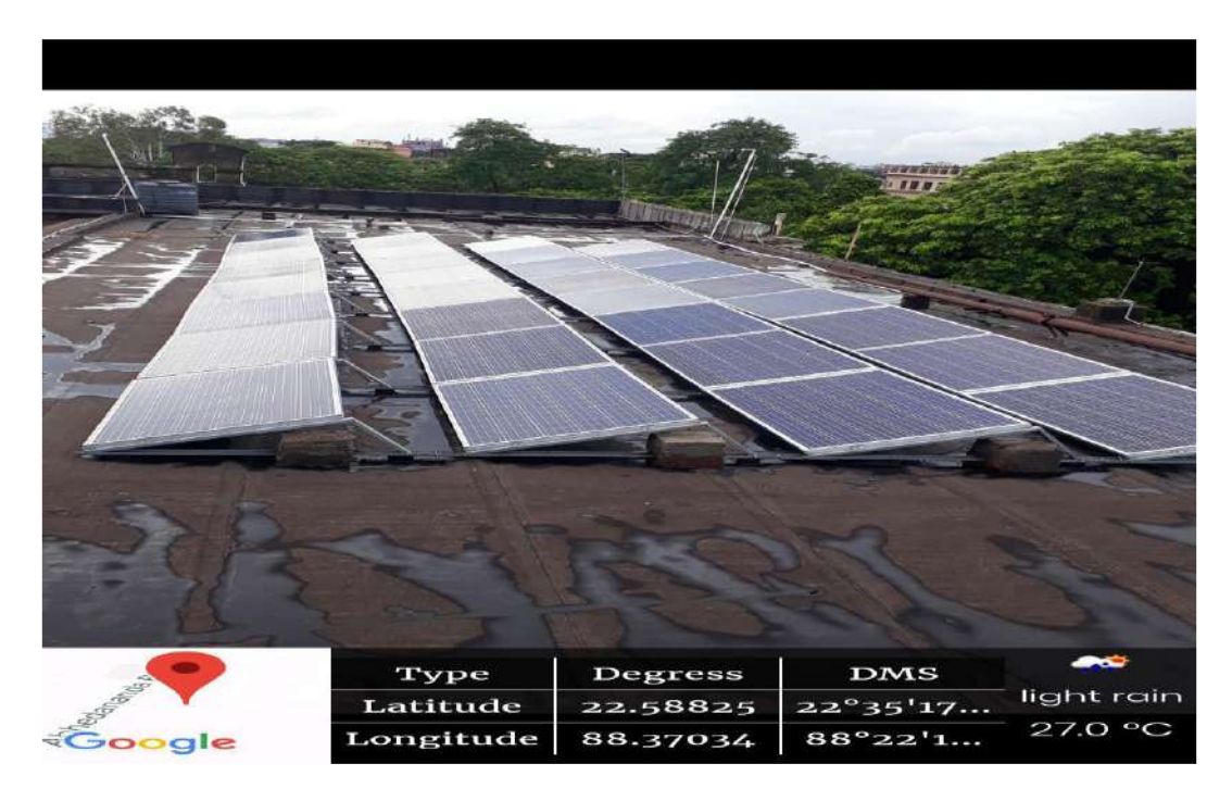
SOLAR PANELS ON ROOFTOP